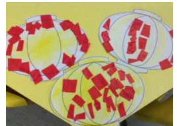
Year 1 lanterns