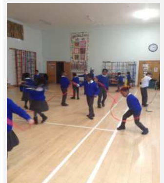
Year 2 Chinese Dance